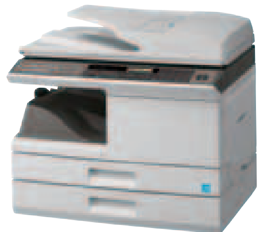
Shown with RSPF, optional second paper tray and fax kit